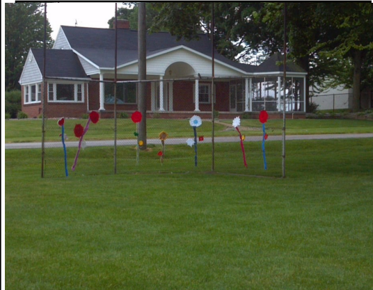
Yarn flowers from the great Yarn Bombing!

Are you ready for Spring? I know I am! No matter how light the winter, those first crocus are always an exciting sign of fun to come. This year we are planning to expand our programming and we are looking for your ideas! Let us know what you want to learn? Do you want to see a class on bone broths? What about the super natural? Are you interested in old books, learning languages or something else?